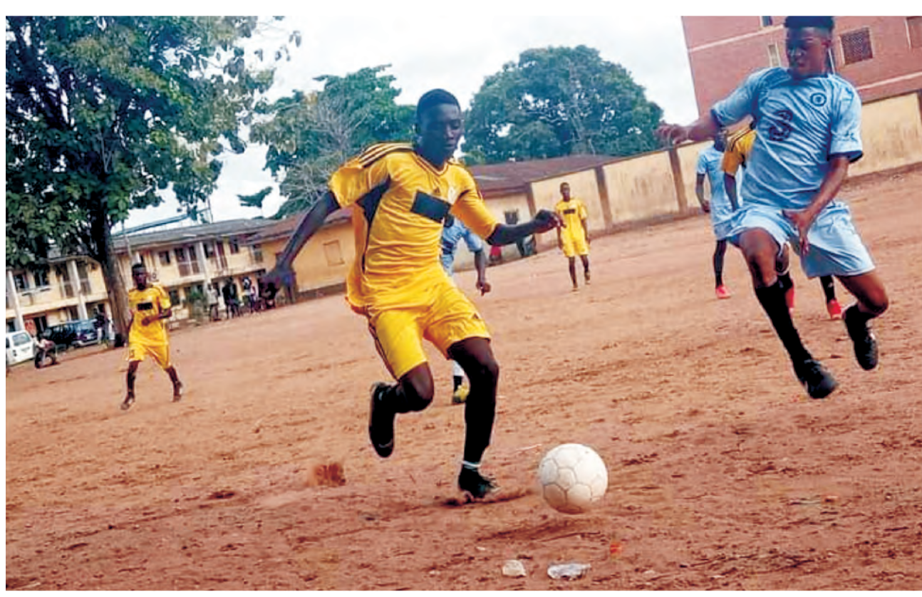
Ghetto Tigers vs Auxano FC

Auxano FC picked up their pieces after conceding the goal but they could not get the Ghetto Tigers' performance equalising goal as Ghetto